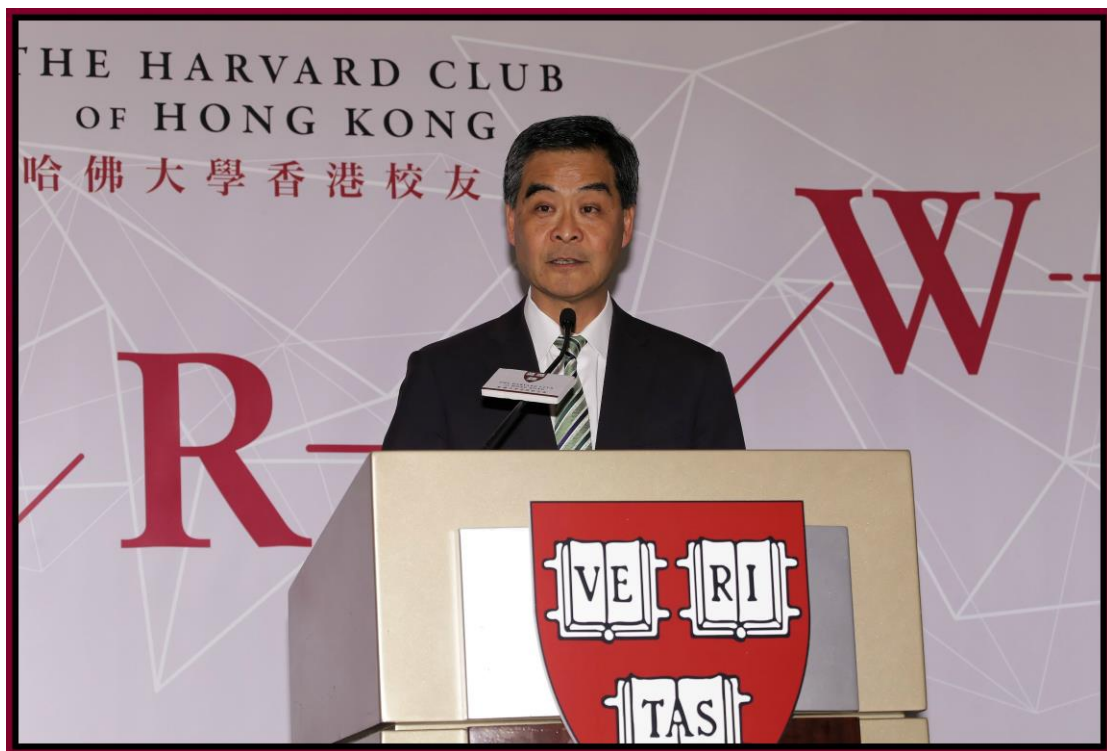
The Honourable Chief Executive of the HKSAR, CY Leung

We hoped you are inspired from our speakers at the Conference including: